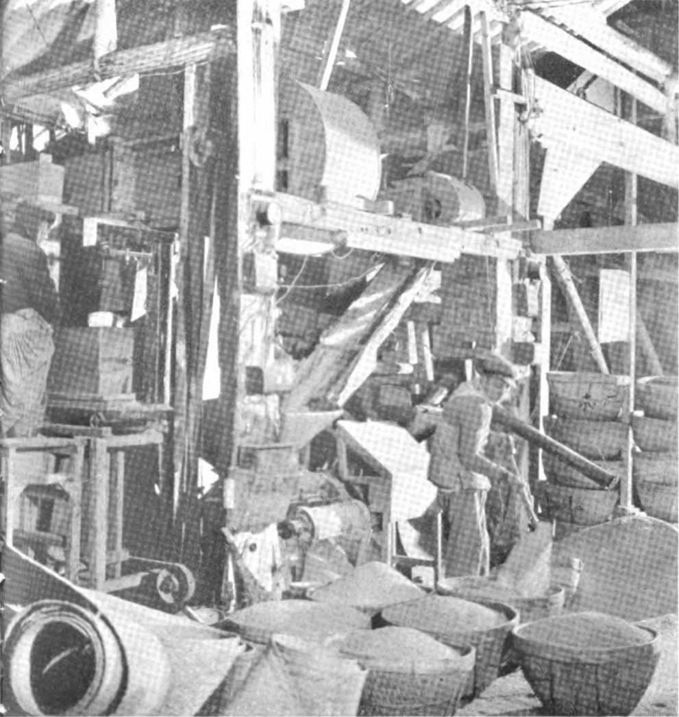
Food-processing factory, Kwangfu Commune, Kiangsu Province