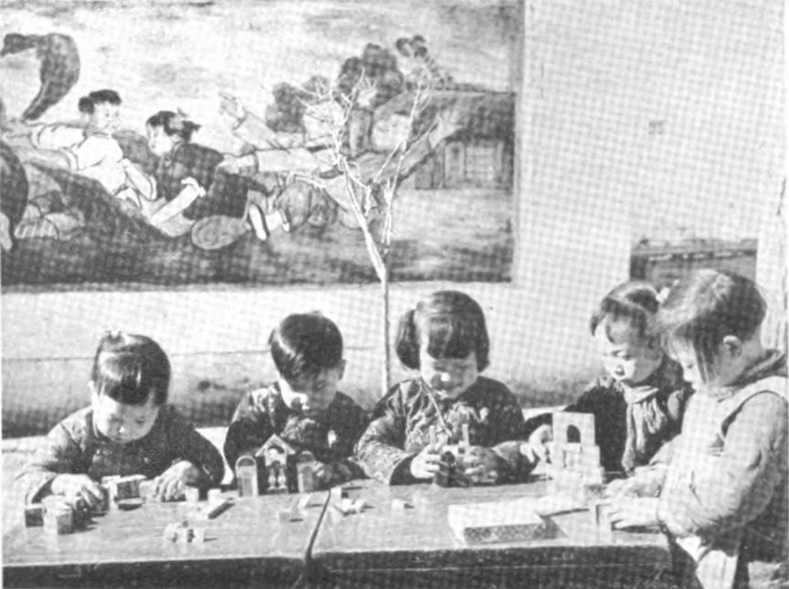
Kindergarten, Shansi Province