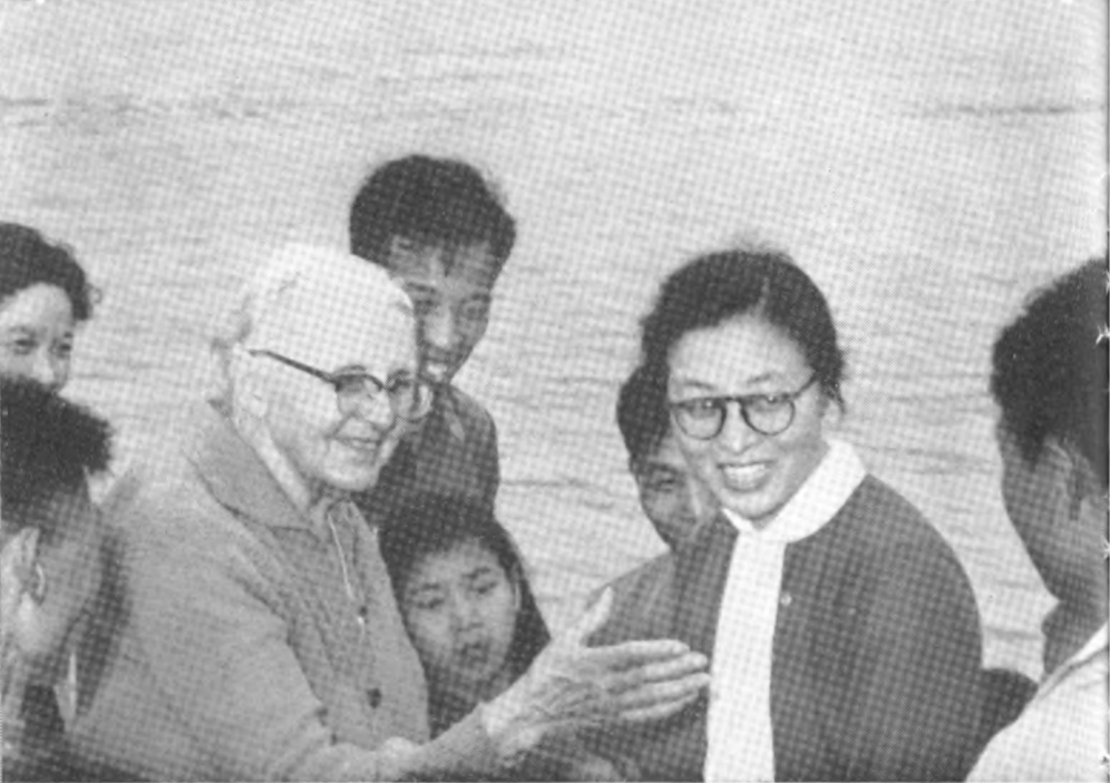
Interviewing Sanshan Commune members, Hangchow, as we visit their brigades and pumping stations by motor boat