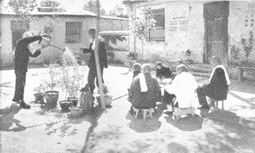
"Home of Respect for Aged" in commune, Hopei Province