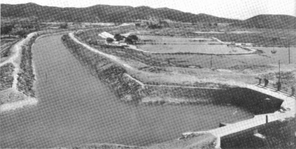
Irrigation canal dug by Huatung Commune, Kwangtung Province