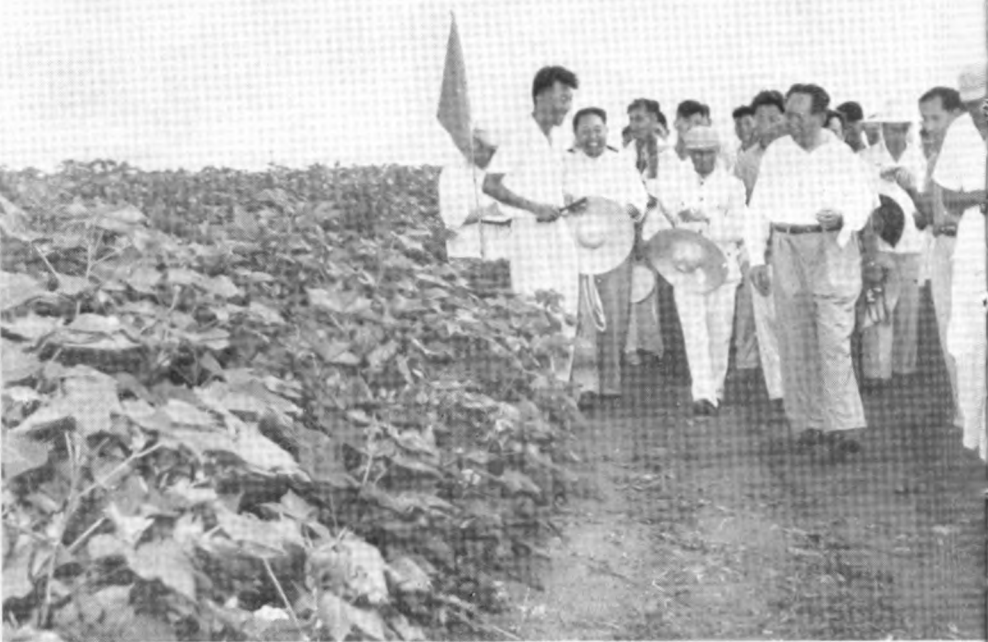
Chairman Mao visits cotton field in Honan Province