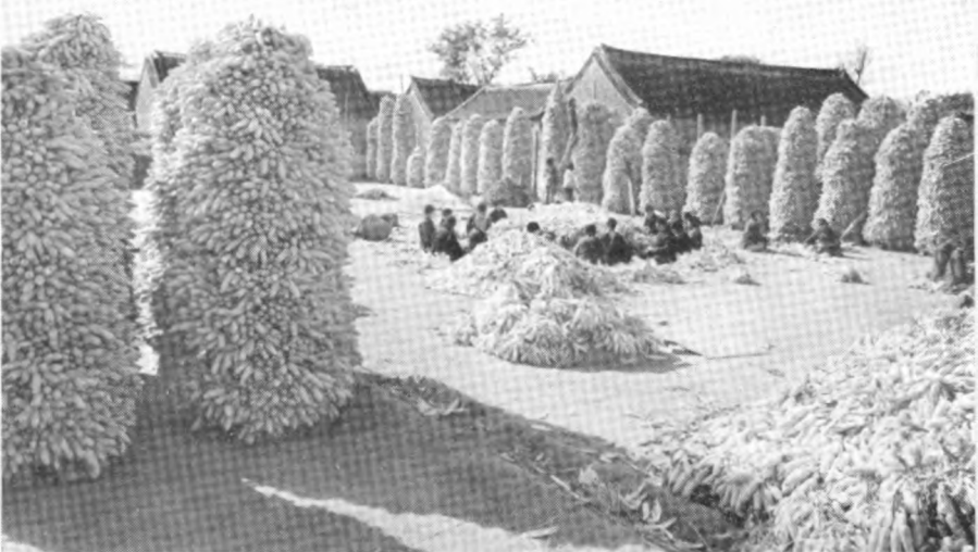
Maize harvest, Pioneer Commune, Shantung Province