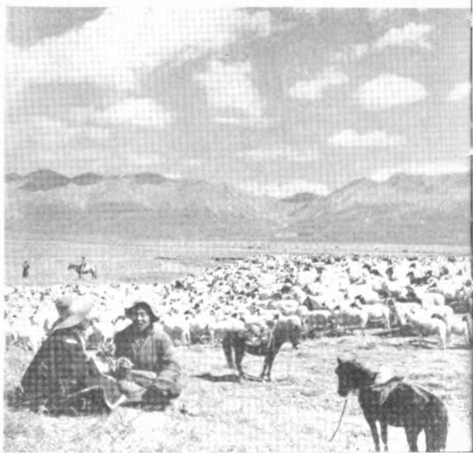
Pastoral commune in Chinghai Province