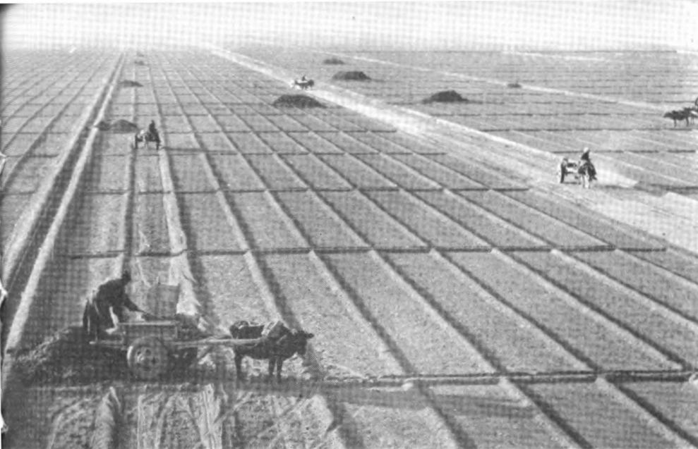
Bringing fertilizer to the cotton field. "Garden-farming" in Hopei Province