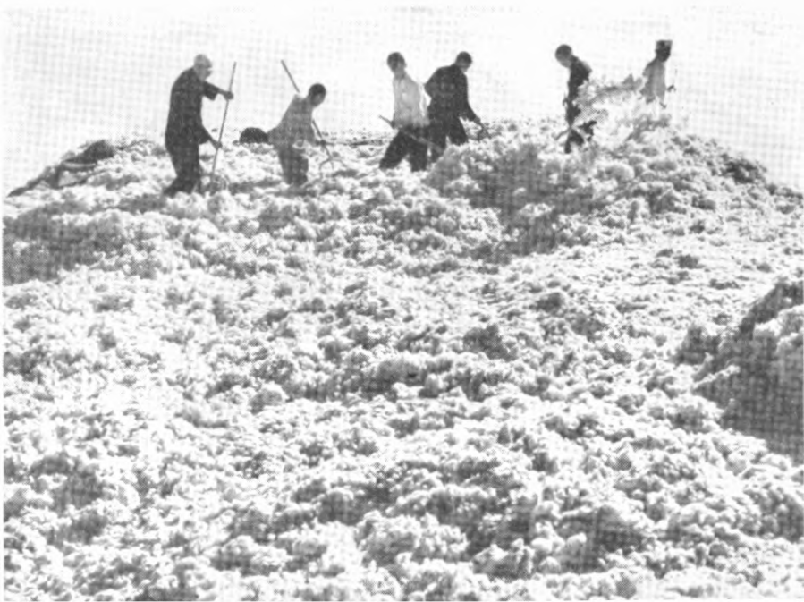
Cotton pile, Honan Province