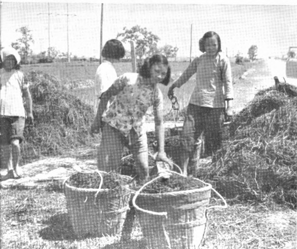
Girls gather "green manure"; half the poorest soil in Kiangsi has been thus improved