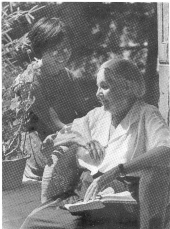
ANNA LOUISE STRONG