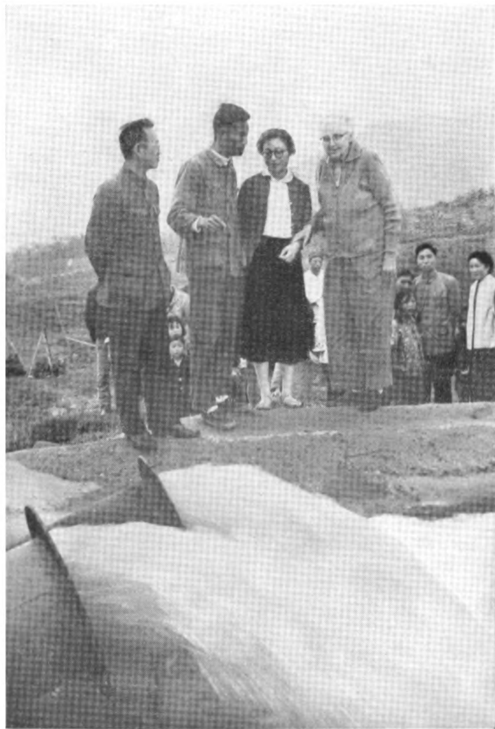
"Three pumps deliver water faster than 240 men could do," explains the commune chairman to the author May 28, 1962