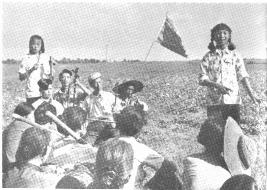
Opera group sings during noon break, Sputnik Commune, Honan Province