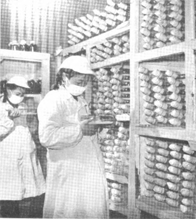
Making bacteriological fertilizer, Hopci Province