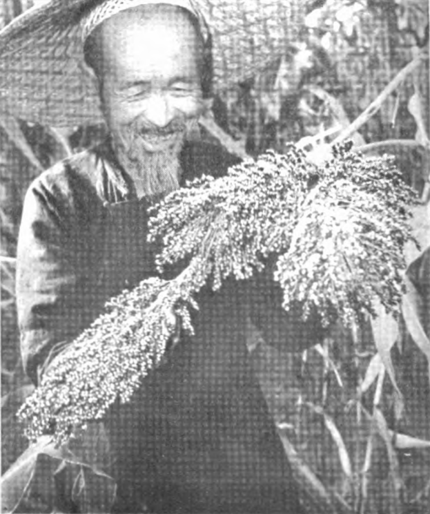
Good sorghum in Heilungkiang Province