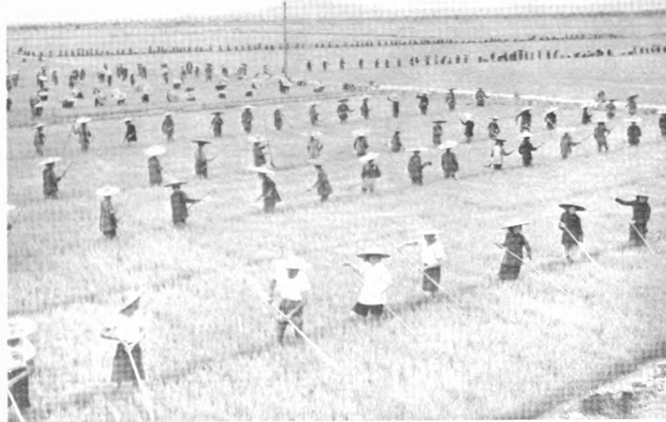
Cultivating close-planted rice with special tools, Kwangtung Province