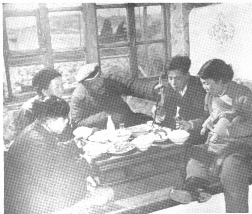
Dinner at home on rest day, commune near Harbin