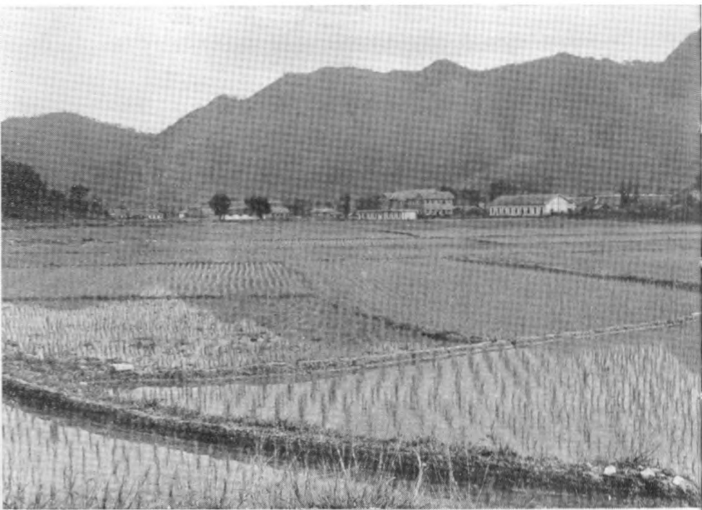
Kiangsi paddy fields need careful, infinite labor