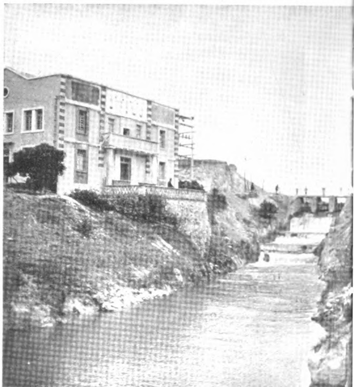
A power station built on the canal