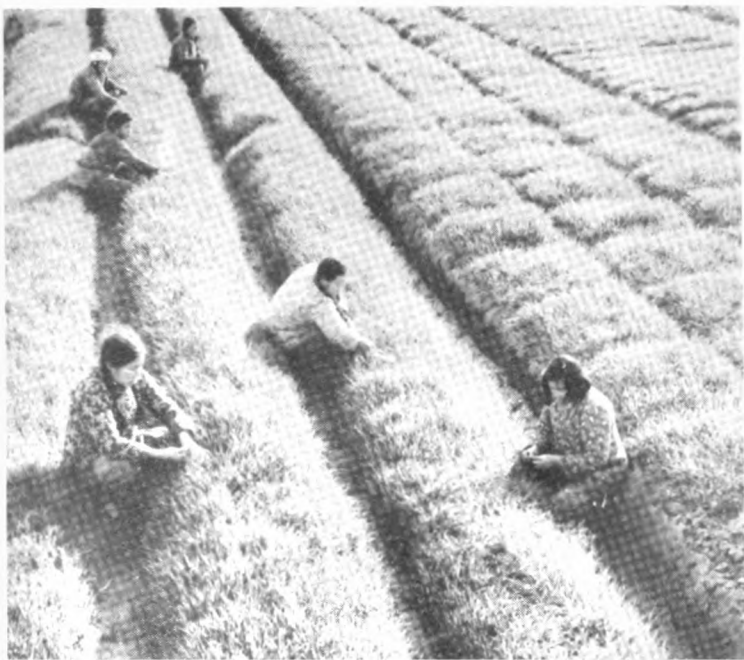
Close-planted wheat, Szechuan Province