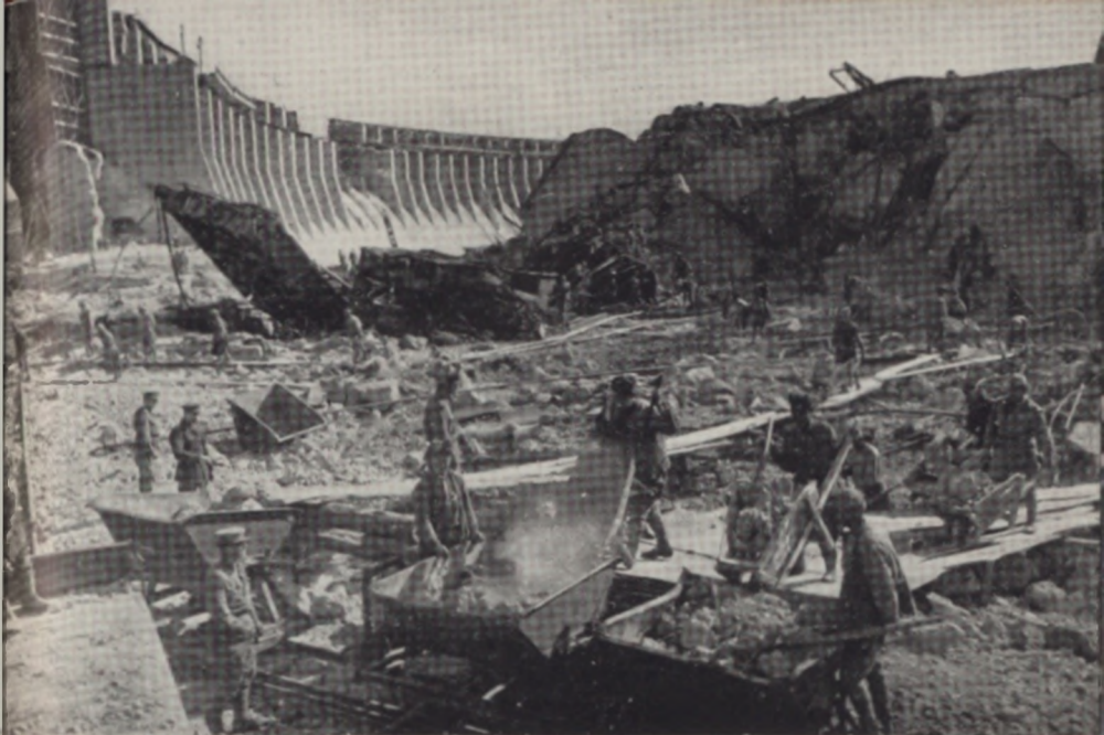
Reconstruction is begun on the Dnieprostroi