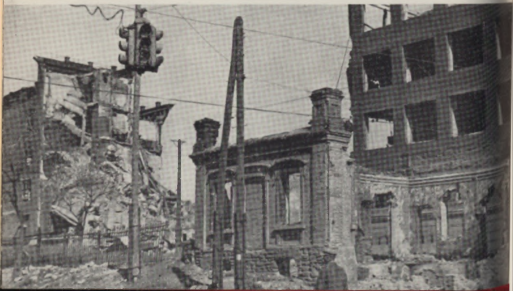
Gutted buildings in the wake of the Nazi retreat