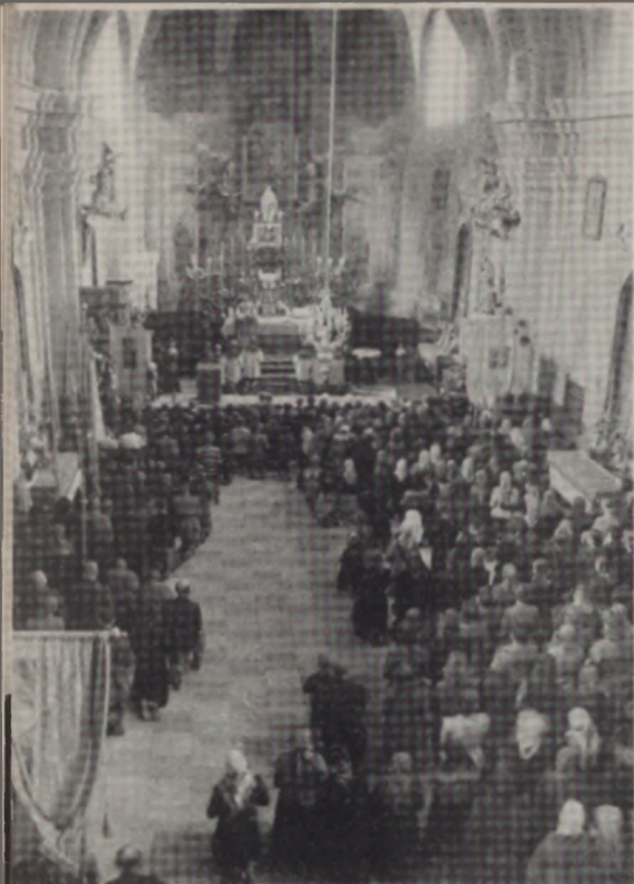
Church services in the territory liberated by the Soviet armies