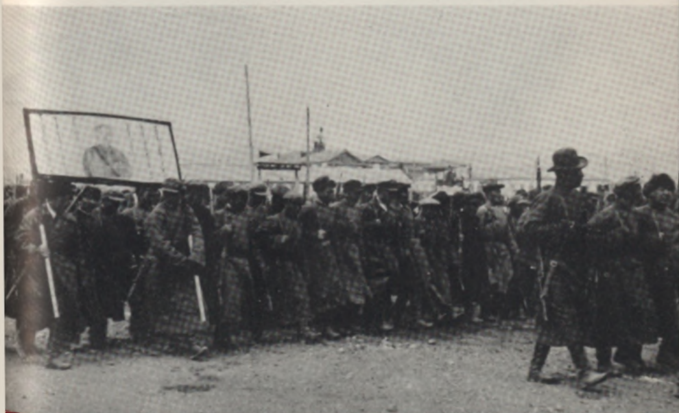
Defenders of Mongolia