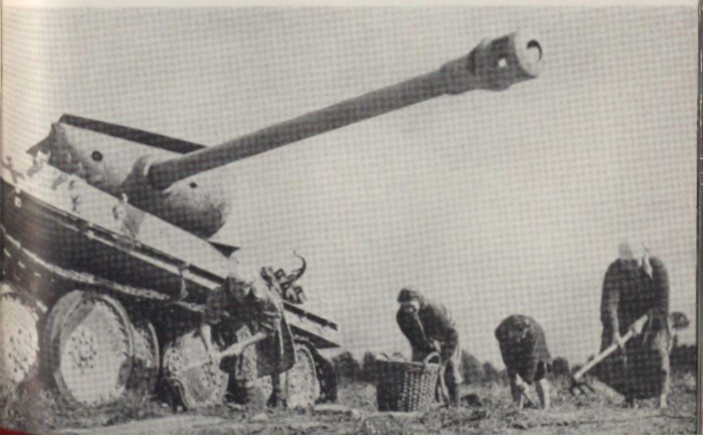
Tilling the soil around an abandoned German tank