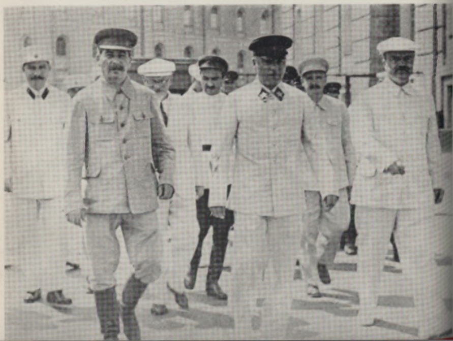
Government heads on their way to a Red celebration