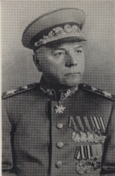
Marshal K. E. Voroshilov

A new generation of Soviet leaders—students of the Suvorov Military School