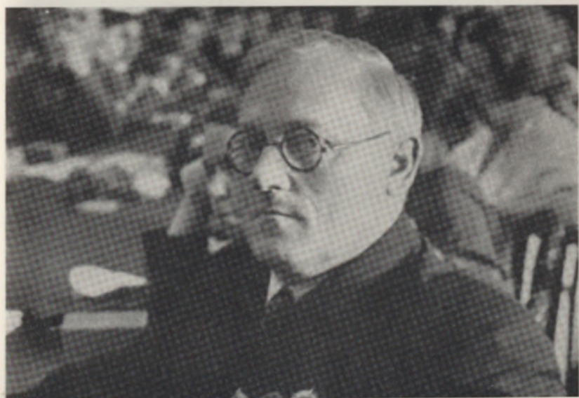
A. Y. Vishinsky, Procurator of the USSR