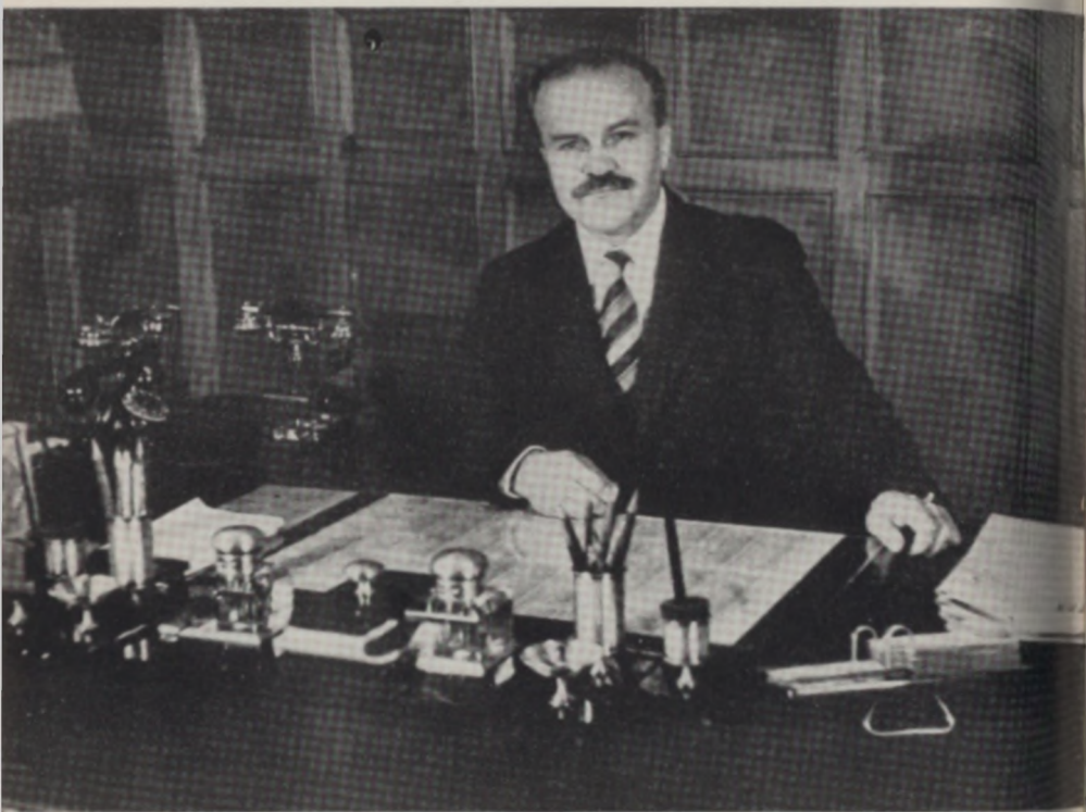
Vyacheslav Molotov, Commissar of Foreign Affairs