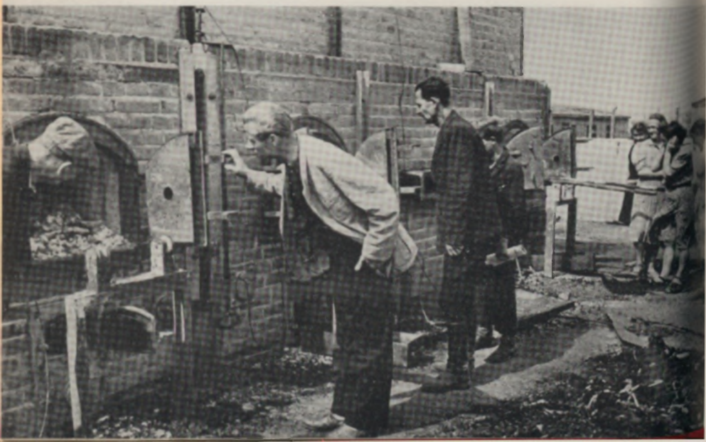
Human incinerators in Maidanek