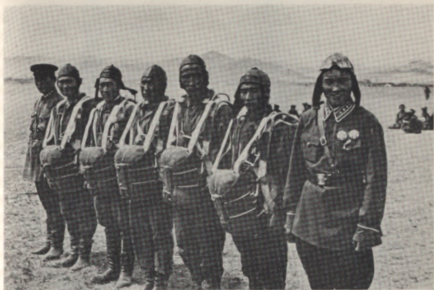
Red Army parachutists on the Mongolian front