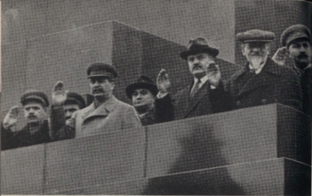
Leaders of the Soviet Government at Lenin's tomb