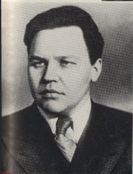
Commissar N. A. Voznessensky