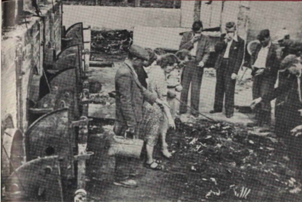
Liberated citizens of Lublin search for their kin