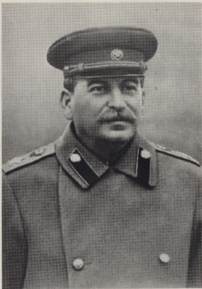
Marshal Joseph Stalin