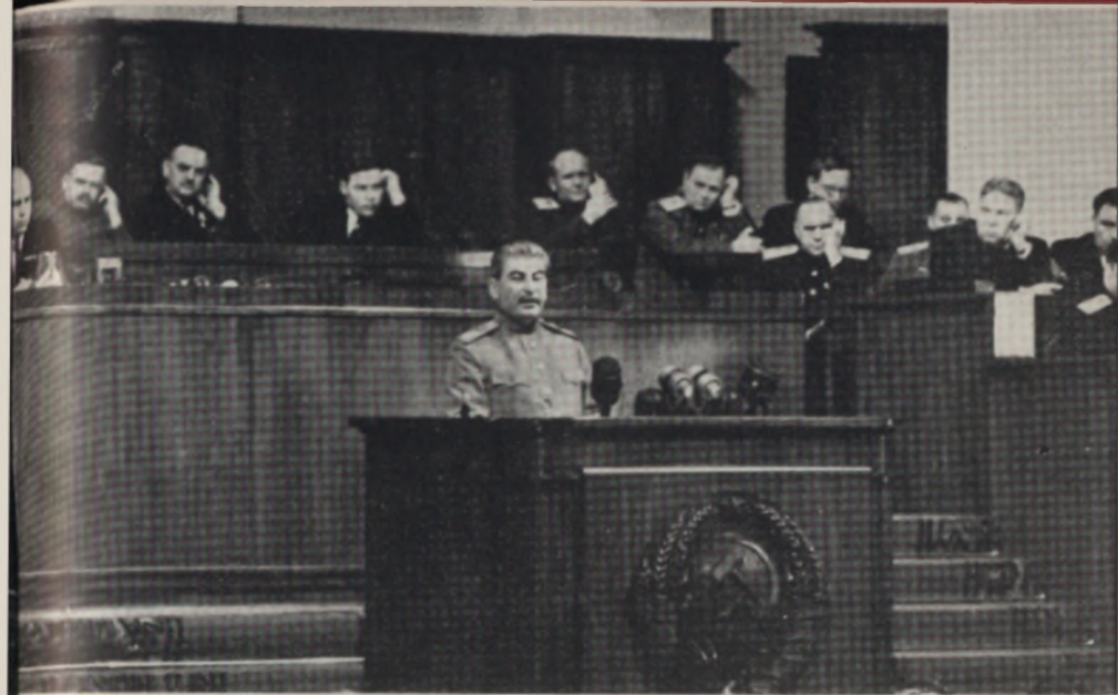
Stalin addresses Soviet Commissars