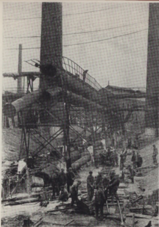
Nazi destruction in the Donets Basin