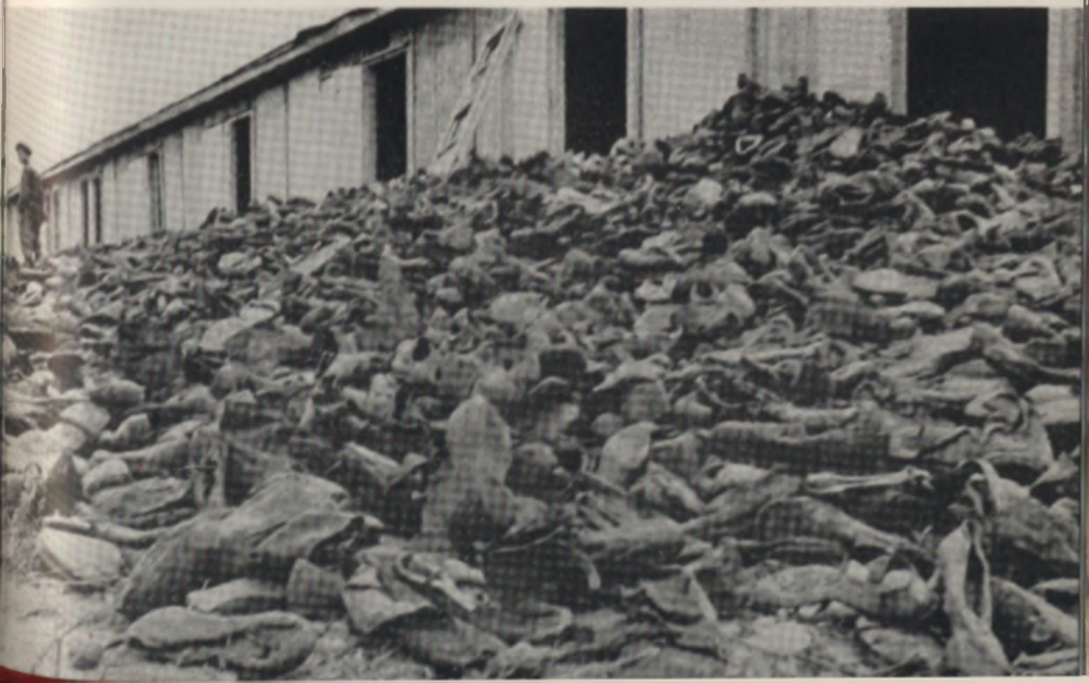
Nazi stock pile of victims' shoes