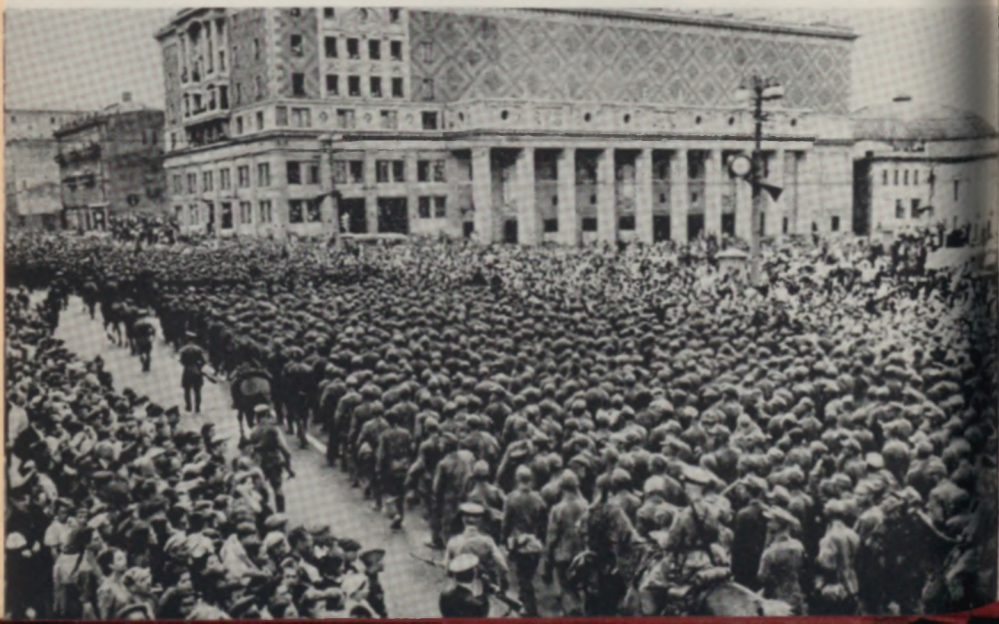
Nazi prisoners marched through Moscow streets