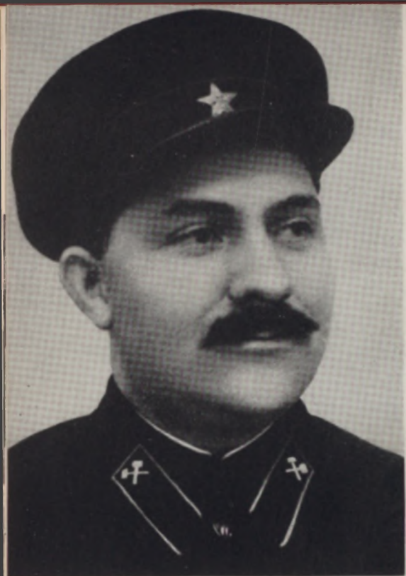
L. M. Kaganovich, Commissar of Heavy Industries