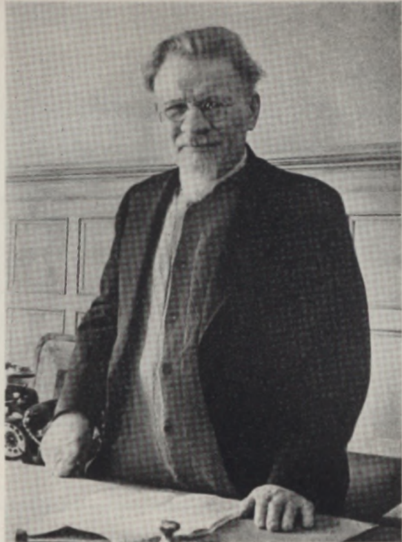
M. I. Kalinin, President of the Presidium of the Supreme Soviet