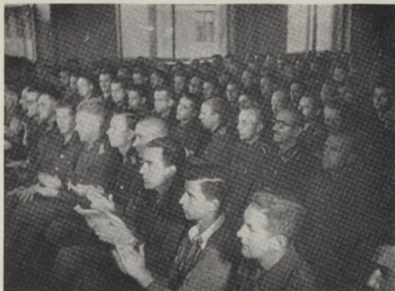
First meeting of the National Committee for Free Germany