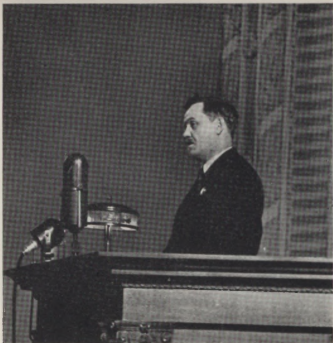
N. Bulganin, Chairman of the Commission on Foreign Affairs of the Soviet of Nationalities