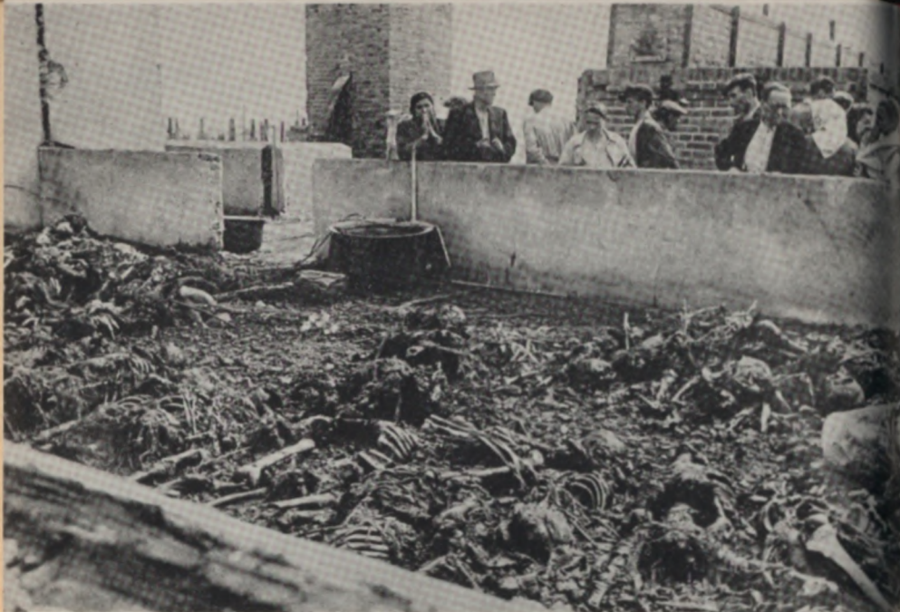
The trail of the Nazis