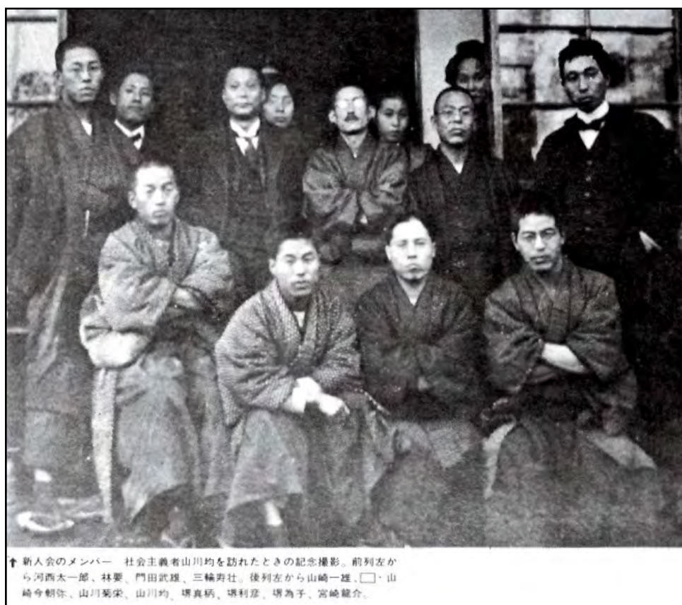
Figure 1. Group of young Japanese socialists. Yamakawa Hitoshi is in the upper row, third from left. Source : Nihon Kindaishi Kenkyūkai (1964, 12:44).

Western scholarship as marginal in comparison to the liberal-democratic movements of the interwar period.