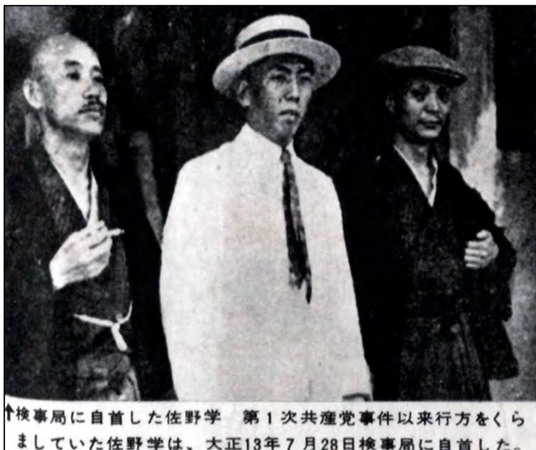
Figure 4. Sano Manabu.