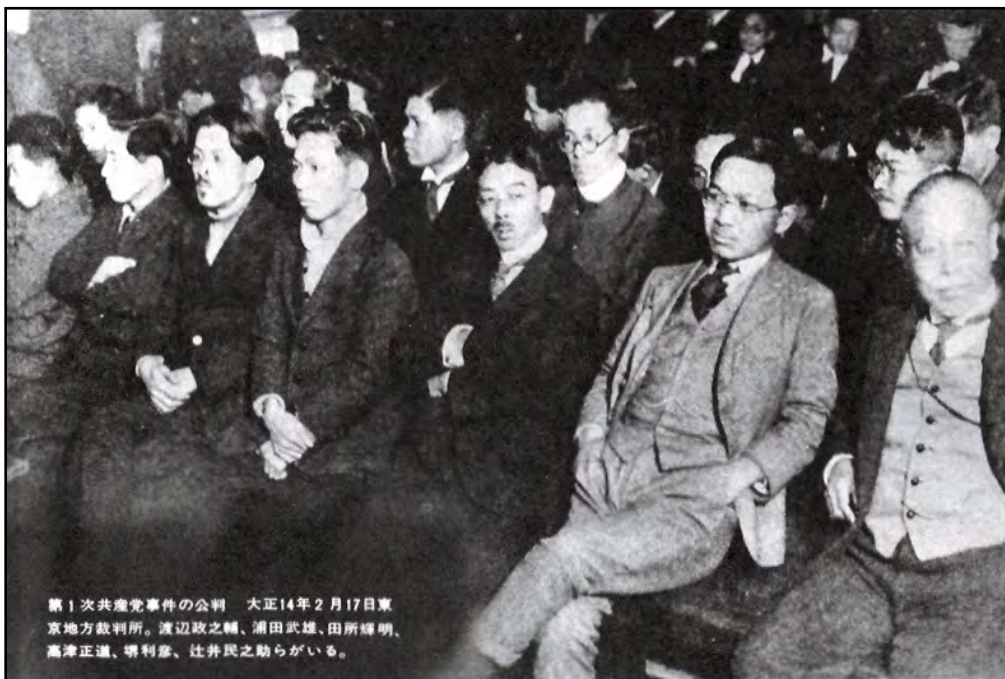
Figure 2. The early JCP on trial, February 17, 1925.

Japanese socialists, forcing them to reconsider the readiness of the Japanese proletariat for an internationalist socialist revolution. Adding to the shock were the murders of a number of known leftists, including the anarchist Ōsugi Sakae, by the military police. At a meeting on October 22, 1923, the remaining members of the JCP, demoralized by the arrests, murders, and general devastation of the city, decided to disband the party. In March 1924, members of the JCP who managed to escape to Vladivostok and Shanghai established the foreign bureau of the Japanese Communist party in Vladivostok, which acted as an intermediary between Moscow and the remaining Communists in Japan. 11