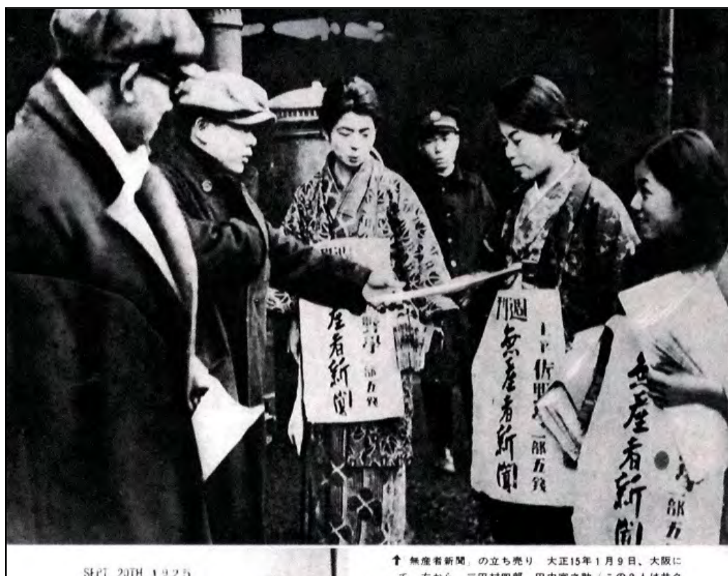
Figure 5. Women distributing the Communist newspaper Musansha shinbun on the streets of Osaka, January 9, 1926.

Farmer Party), and Rōdō nōmin tō (the Worker-Farmer Party). All three parties had ties to the illegal JCP. The league organized a commission to investigate Japanese military actions in China. Its twelve members were, however, arrested in Fukuoka en route to Shanghai in August 1927.