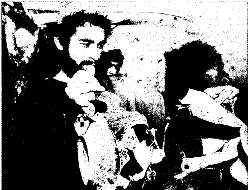
Afghanistani wedding bombed by US.

The events of 11 September gave imperialism, headed by US imperialism, the opportunity to begin a campaign of aggression in the name of the "war on terrorism". Whilst this campaign was initially aimed at the imperialists' own reactionary creations, such as al-Qaeda and the Taliban, it is the proletariat and oppressed people of the world and their revolutionary struggle that is the real target. That is why, sooner or later, the revolutionary struggle of the people, particularly people's war under the leadership of Maoists, will in practice become the real target of attack.