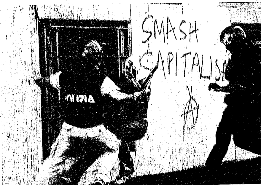
Above and below, Genoa.

Seattle, Prague, Nice, Washington, Cancun, Quebec, Gothenburg, now Genoa.... Wherever and whenever the leaders of the major imperialist powers gather, they are confronted by increasingly organised and powerful opposition to their crimes. Whereas previously they had been accustomed to organising their "new world order" in luxurious obscurity, now their every move is hounded.