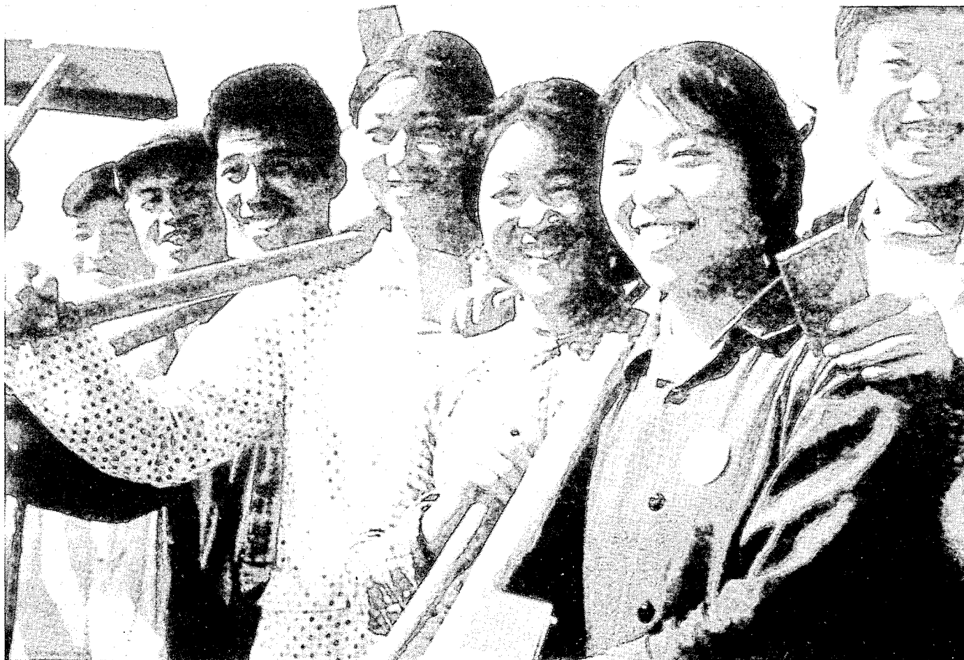
Peasants during the Cultural Revolution, holding Quotations of Chairman Mao Tsetung. Collectivisation of agriculture helped lay the basis for the liberation of women.

siders that a cardinal problem of the CCP was its treatment of the family as an ideological phenomenon, Wolf considers that the CCP didn't pay enough ideological attention to the family: "Social planners in China, alas, have ignored the fact that patriarchal thinking, the ideology of the men's family system, pervades every aspect of Chinese society and continues to inhibit women's full participation in political as well as economic life. Although there were brief spurts of ideological retraining in 1953 during the Marriage Law campaign, and again in 1974-75 during the Anti-Confucius campaign, the restructuring of the Chinese family has been left to the natural erosion expected to result from other societal changes. Of more concern to the CCP was the destruction of the power of the lineages and of the landlord class