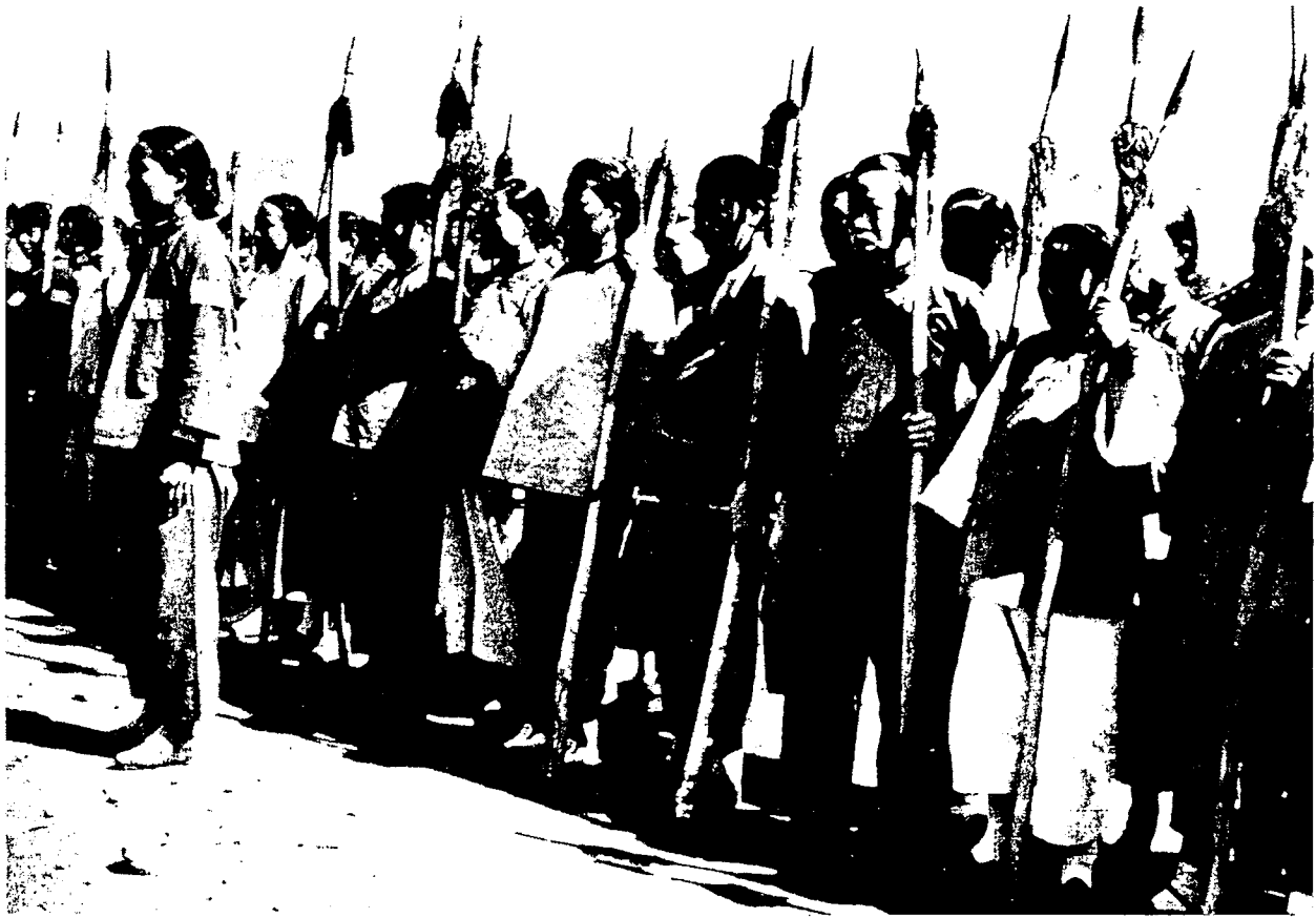
Women guerilla fighters during the national liberation war.