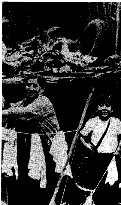
Shantytown near Lima.

c. The three instruments of the revolution. To make revolution there must be a Communist Party as the leading and highest form of organisation; a revolutionary army as the principal form of organisa-