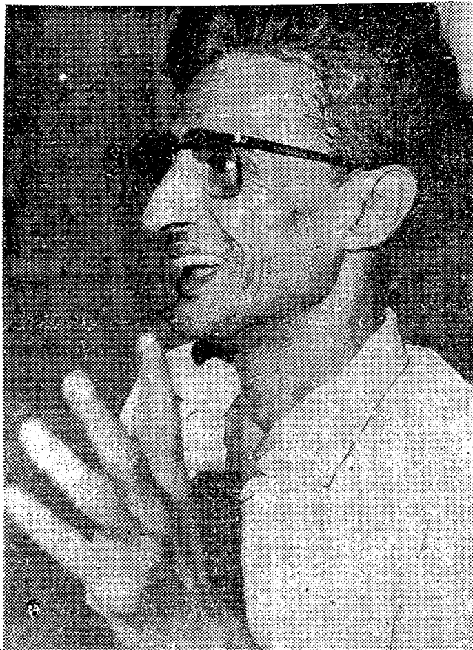
Charu Mazumdar, leader of the Communist Party of India (Marxist-Leninist), martyred July 28, 1972.

The death of Indira Gandhi and the surrounding events underscore one thing if nothing else: the hold of the reactionary ruling classes and imperialism on India is shaky. The objective conditions for revolution--the inability of the masses to live in the old way and the inability of the ruling classes to rule in the old way--are rapidly ripening. The subjective factors for revolution, the communist forces, are also rapidly developing in India. These forces are engaged in the important process of struggling to come to a correct understanding of the nature of Indian society and the transformation it is going through