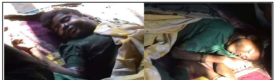
Young women gang-raped and killed at Majjimdri village, Dantewada distt.