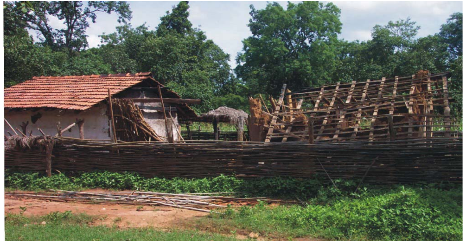
Example of house burnt

Angered by this action the police/para-military took out their venom on the Kotrapal villagers and launched an inhuman