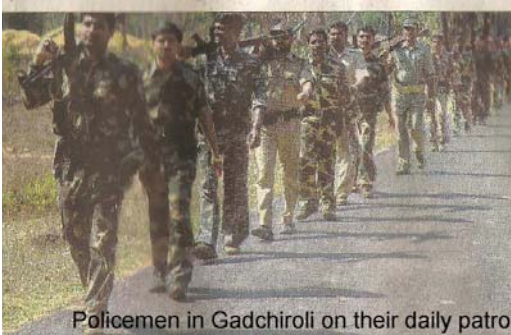
Policemen in Gadchiroli on their daily patrol

Of significance is the number of killings that has happened ever since the commencement of the Operation Green Hunt, say from the third week of September under the gaze of the 'Reality Show' driven sensation hungry media wherein more than 4000 CRPF and 600 anti-Naxal CoBRA commandos entered Dantewada's Chintagufa area. People resisted this intrusion by the government's armed forces, and in the battles six soldiers, including two commanding officers were killed.