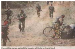
Paramilitary men patrol the jungle of Berla in Jharkhand.