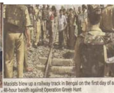
Maoists blow up a railway track in Bengal on the first day of a 48-hour bandh against Operation Green Hunt