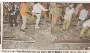
Cops examine the blown-up portion of track near Gaya station