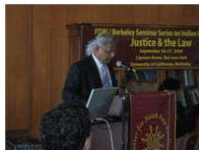
DGP Vishwa Ranjan