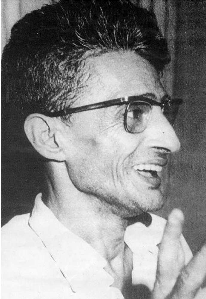
Comrade Charu Majumdar