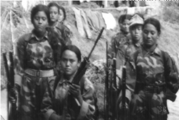
PLA Fighters. Nepal

The Maoists of Nepal have liberated the bulk of the countryside