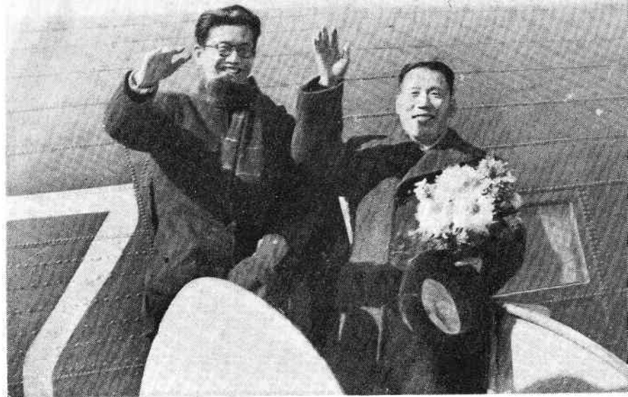
Wu Hsiu-chuan (right), head of the 9-man delegation of the People's Republic of China, and Chiao Kuan-hua (left), adviser to the delegation, leave Peking for Lake Success on Nov. 14, 1950.

At the same time, I must call the attention of the representatives of those countries which are prepared to support such a manoeuvre of the United States. If you do so, it would mean that you are taking a further step in supporting the United States aggression. It would mean that you are making enemies of the 475 million people of China and of the people of the whole world who love peace and oppose war. The people of China and the people of the whole world would not lightly forgive you. You must bear the full responsibility for the inevitable consequences of your actions.