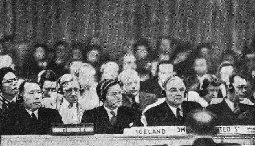
Wu Hsiu-chuan at the meeting of the U.N. Political and Security Committee on November 27, 1950.