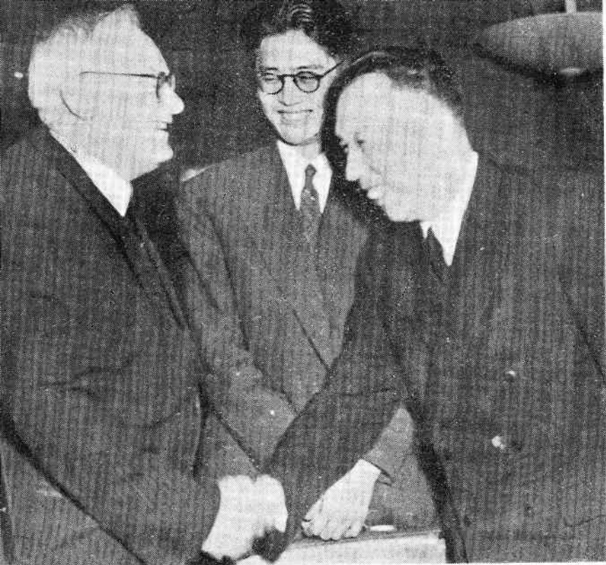
A. Vyshinsky (left), Soviet Foreign Minister, welcomes Wu Hsiu-chuan (right) and Chiao Kuan-hua (centre) on their arrival at Lake Success.