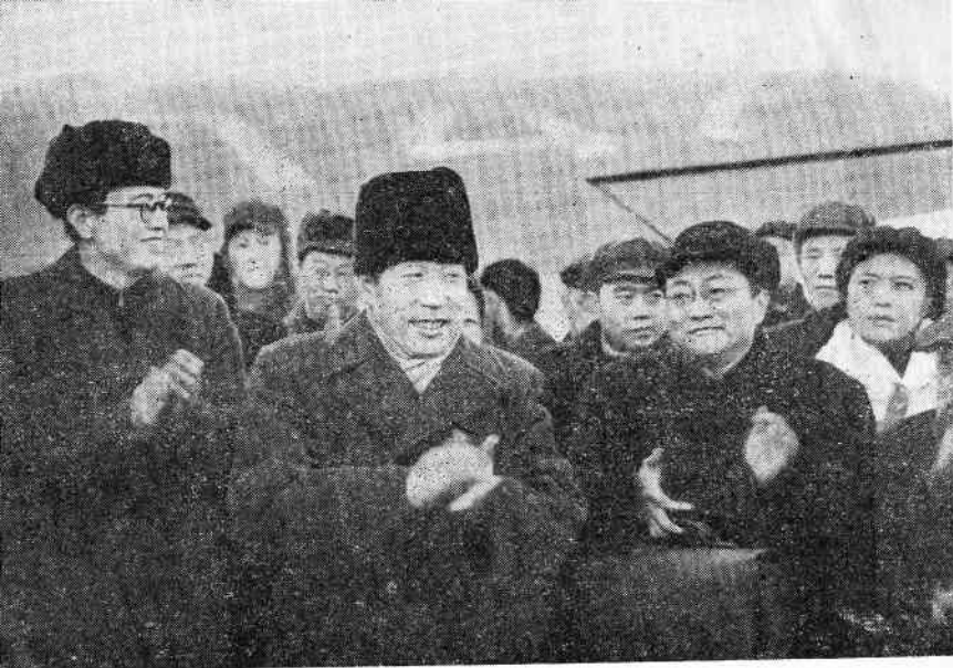
At the Peking airfield the delegation is warmly welcomed by Government representatives on its return. On the right, next to Wu Hsiu-chuan is Chang Han-fu, Vice-Minister of Foreign Affairs of the Central People's Government.

President Truman of the United States and Secretary of State, Mr. Acheson, have constantly referred to the "crisis" in the present international situation. Yes, there is indeed a "crisis" in the present international situation. But we would like to ask: What is the origin of this "crisis"? The origin of this crisis is the aggressive and war policy of the American imperialists. A handful of the American imperialist aggressors are determined to extend aggression and to demand world war, thus creating the so-called "crisis" in the present international situation. People of the whole world are opposed to war.