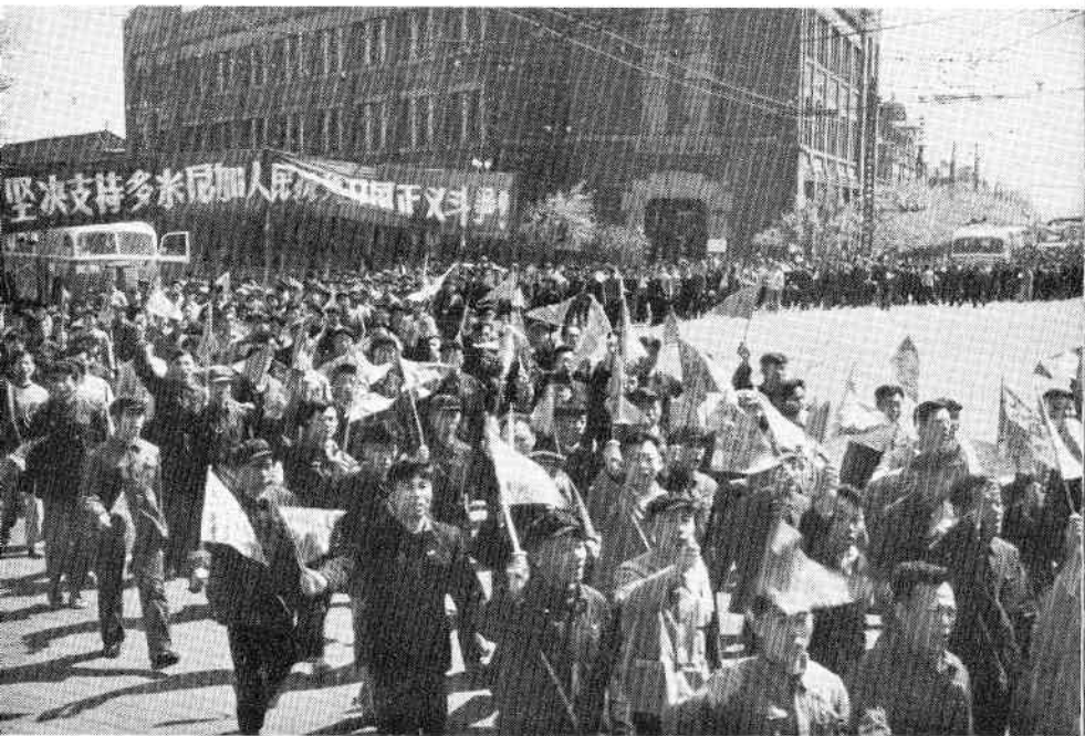
The workers of Shenyang cry: "U.S. imperialism, get out of the Dominican Republic!"