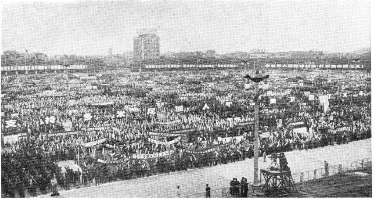
The huge rally in Shanghai in support of the Dominican people against U.S. aggression