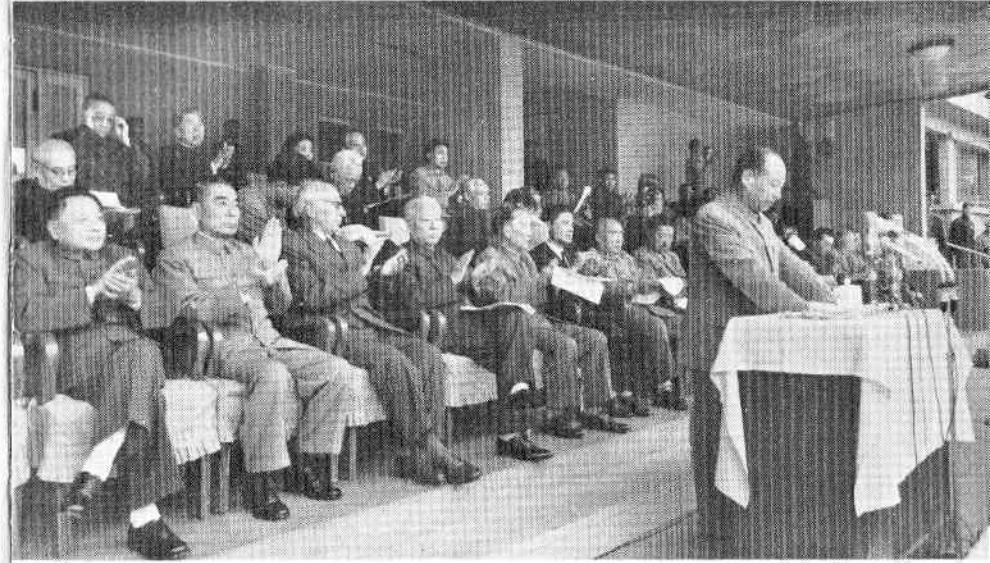
The mass meeting is addressed by Peng Chen, Member of the Political Bureau of the Central Committee of the Communist Party of China and Mayor of Peking

A mammoth mass rally was held in Peking, on May 12, 1965, in support of the Dominican people's resistance to U.S. armed aggression