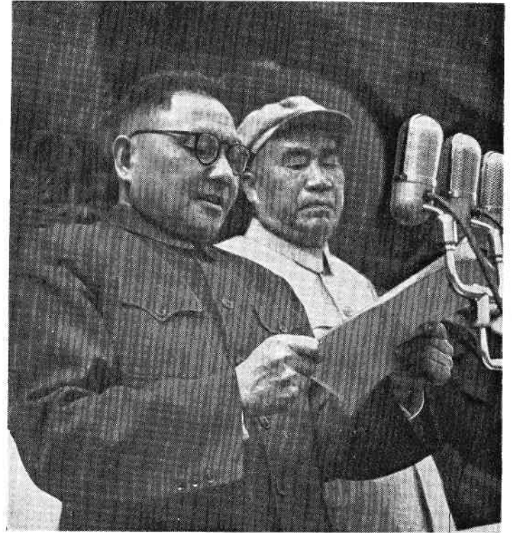
Teng Hsiao-ping, General Secretary of the Central Committee of the Chinese Communist Party, addressing the mass rally of the people of all walks of life held in Peking in support of the just stand of the Soviet Union and against U.S. imperialism's wrecking of the four-power conference of government heads