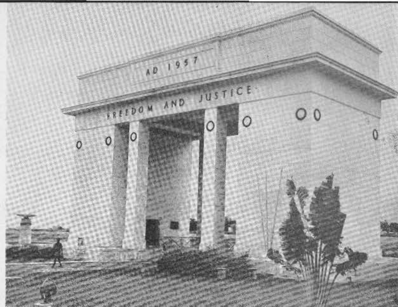
Arch of Independence on the February 28 Road, Accra, Ghana