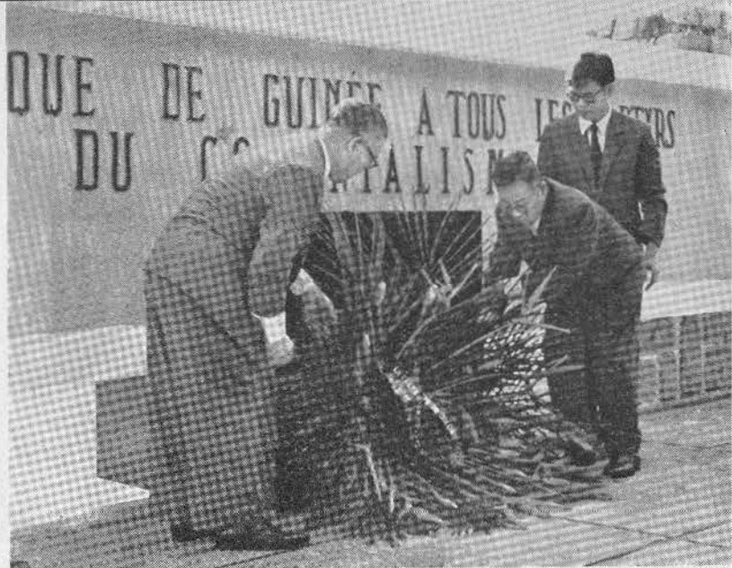
The delegation of the Chinese-African People's Friendship Association places a wreath at the foot of the Martyrs' Monument in Guinea