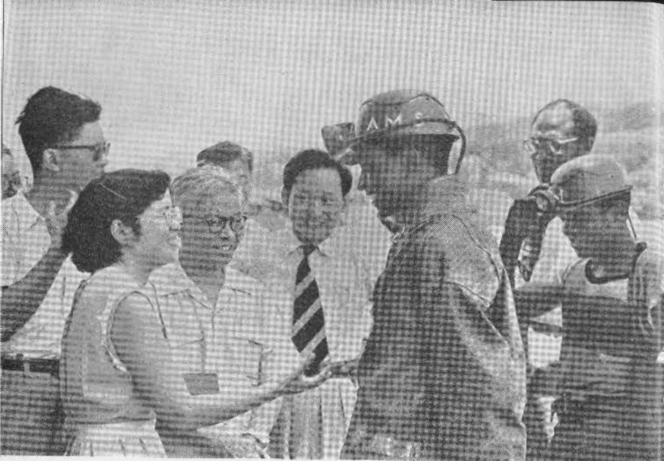
Members of the friendship delegation talk with Ghanaian coal-miners