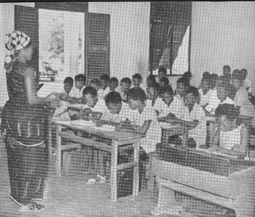
Fourth-graders in a state primary school in Lomé, Togo