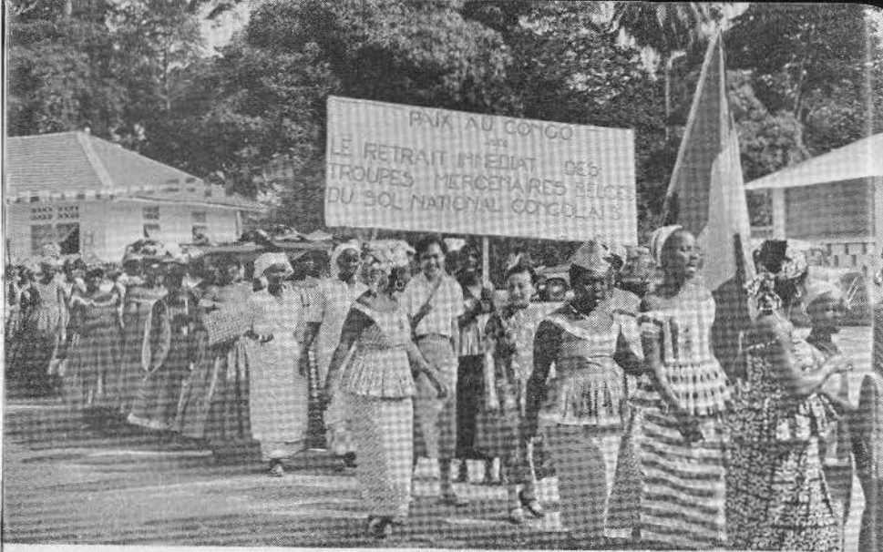
Two women members of the Chinese delegation marching in the International Working Women's Day demonstration at Kissidougou, Guinea