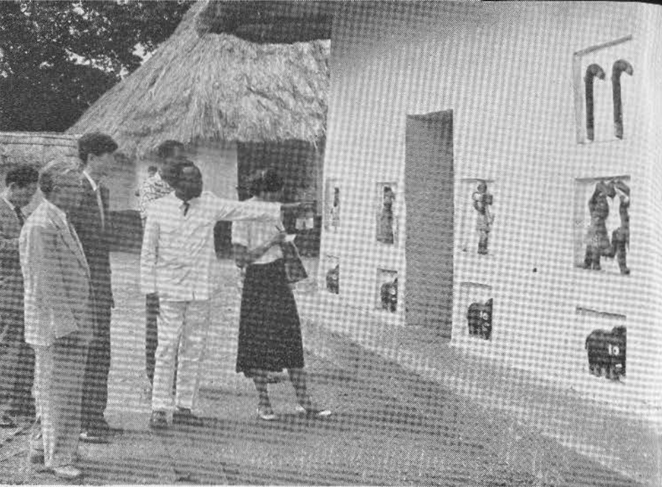
The delegation of the Chinese-African People's Friendship Association visits a museum in Abomey, Dahomey