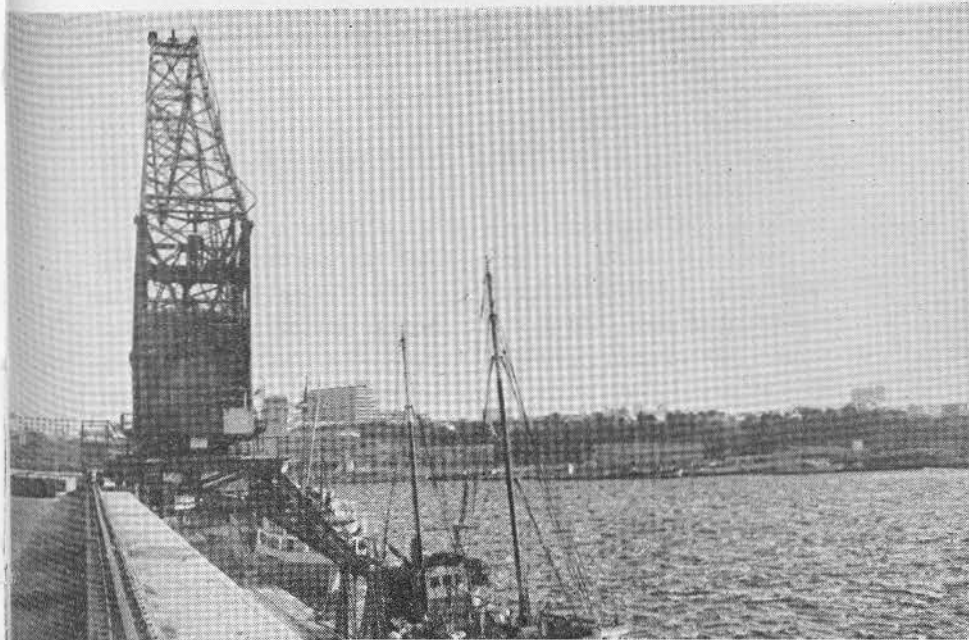
No. 1 Wharf at the port of Dakar, Senegal