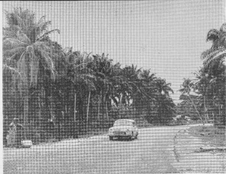
Palm groves, Dahomey