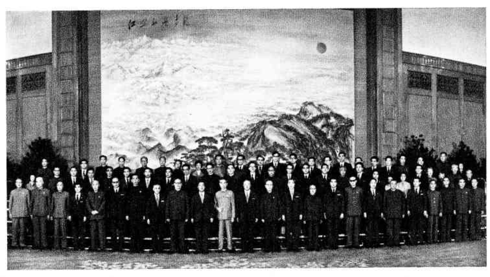
Premier Chou En-lai gives a banquet welcoming Prime Minister Tanaka. Here hosts and guests pose for a picture before the banquet