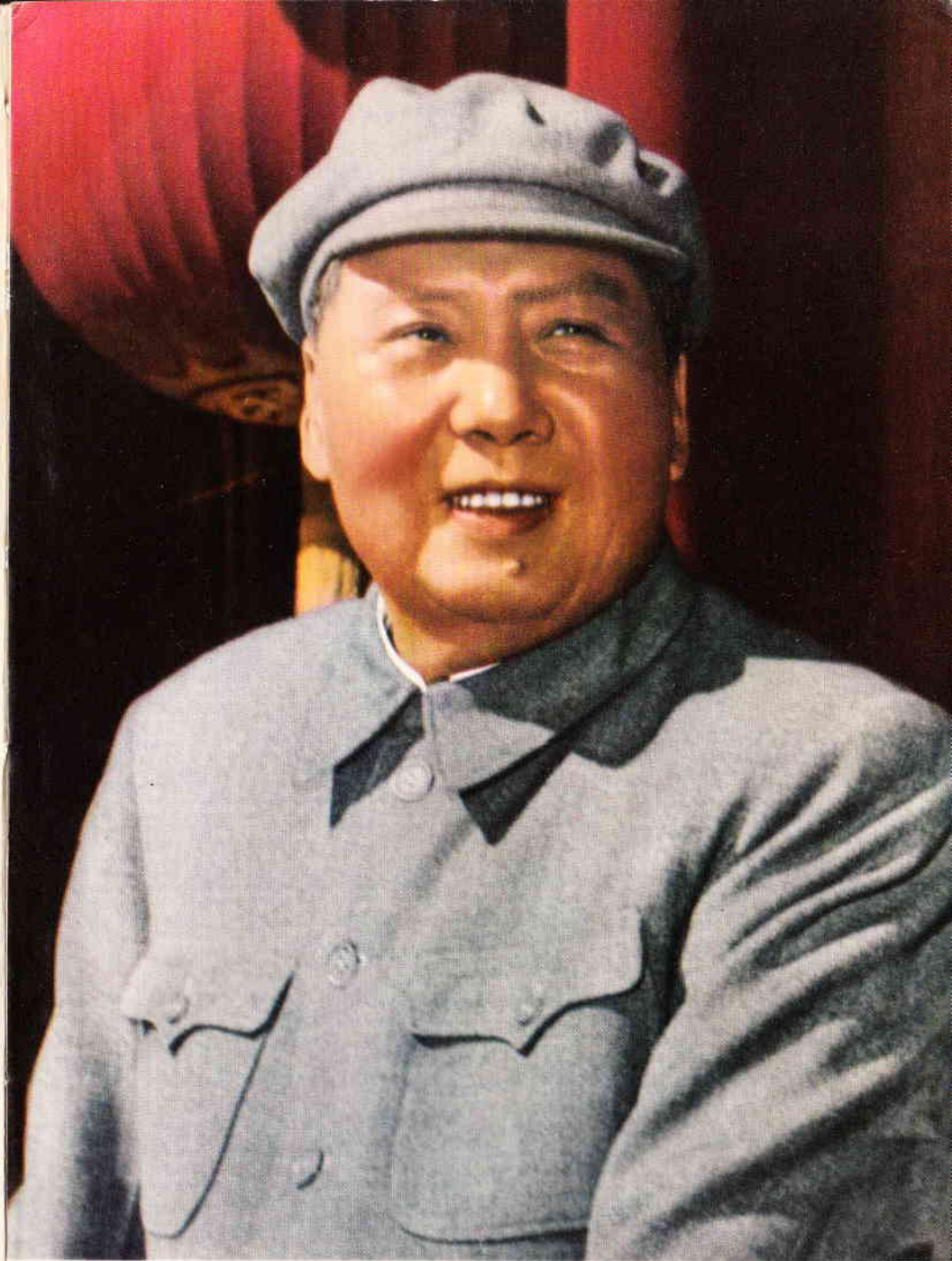
Our great leader Chairman Mao Tse-tung