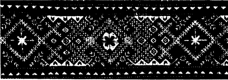
Design for a border

Before liberation the Miao women, suffering from feudal exploitation and oppression, had no chance to study the fine arts. But generation after generation they inherited and developed the craftsmanship of their predecessors. Though they have never studied drawing, they can sketch the beautiful objects they see from memory and then reproduce them with a thread and needle. The more experienced and gifted among them embroider lifelike representations of leaping fish, flying and singing birds, running beasts, flitting butterflies or a single blade of grass or herb. From their practice they have learned the rules of Chinese art, especially of decorative art. In the complex world of flora and fauna, they make a point of capturing the typical posture and features of different objects, instead of striving to achieve a detailed likeness. For they know that even if they succeeded in turning out an exact replica of the real thing, people would not like it so much. Their designs are stylized imitations of nature, vividly and graphically bringing out the special features of the objects delineated.