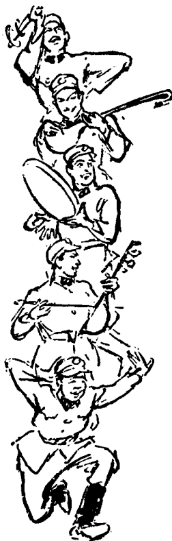
The People's Soldiers Can Do Anything

As little is needed in the way of scenery or stage properties, these brief items can swiftly reflect new happenings and new personalities and can easily be taken on tour. One of these groups from Sinkiang is composed of one Tajik and four Uighur soldiers, all with a good army record, two of them being crack shots. Each can play a musical