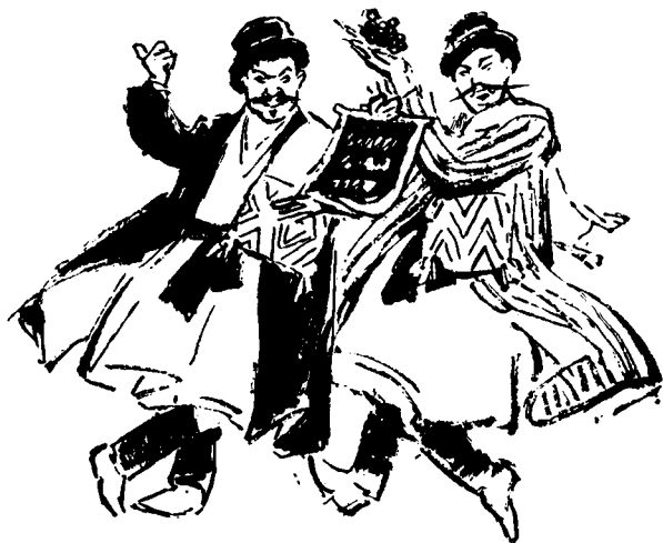
Two Men Deliver Gifts

A team from Lanchow presented a one-act comic opera Fighting for the Basket to show the comradeship in our army units. A squad leader refuses to let his vice squad leader go out to work with the others because he is unwell. But since the squad leader has just returned from a company meeting, the other insists that he must have a rest. Both try to grab the basket for carrying manure and a comic situation arises. Finally the squad leader who has tried to lock up the vice squad leader is locked up himself, and this turning of the tables brings the house down.