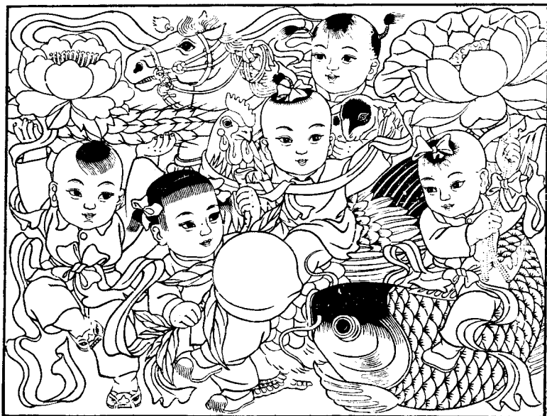
Wealth from Five Sources by Lu Hsueh-chin

content. Strongly contrasting colours, mainly red, yellow and green, form a splendid effect of brightness. And the rich variety of images and strongly decorative character of the painting, far from distracting our attention rather strengthen and enrich the main theme.