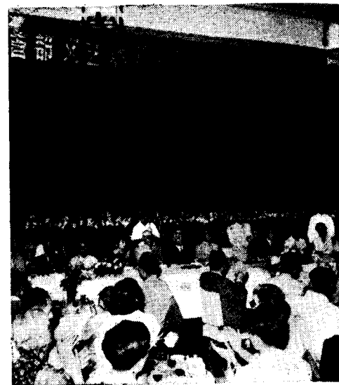
Mao Tun, chairman of the Chinese Writers' Union, speaks at the Peking writers and artists' reception to welcome the Japanese Writers' Delegation

The Japanese Writers' Delegation entered China on May 31. Starting from the first Chinese city they visited — Canton — they were given rousing receptions everywhere as the cultural representatives of the courageous, militant Japanese people. On June 1, the day before they came to Peking, a rally of more than a thousand members of cultural circles in Canton was held to greet the Japanese writers, who have