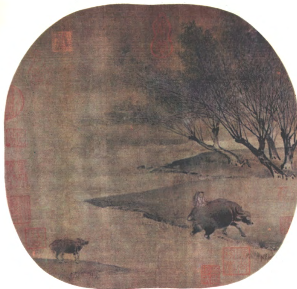
On the Way Home

Old Chin pressed Wang Mien to consent and, to please the old man, he agreed.