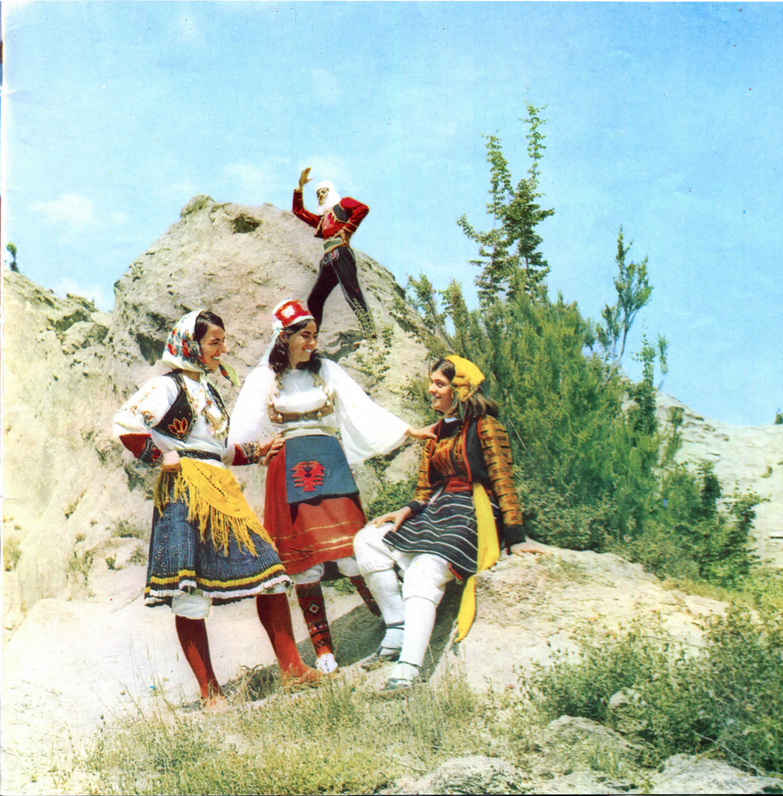
Folk costumes of Northern Albania