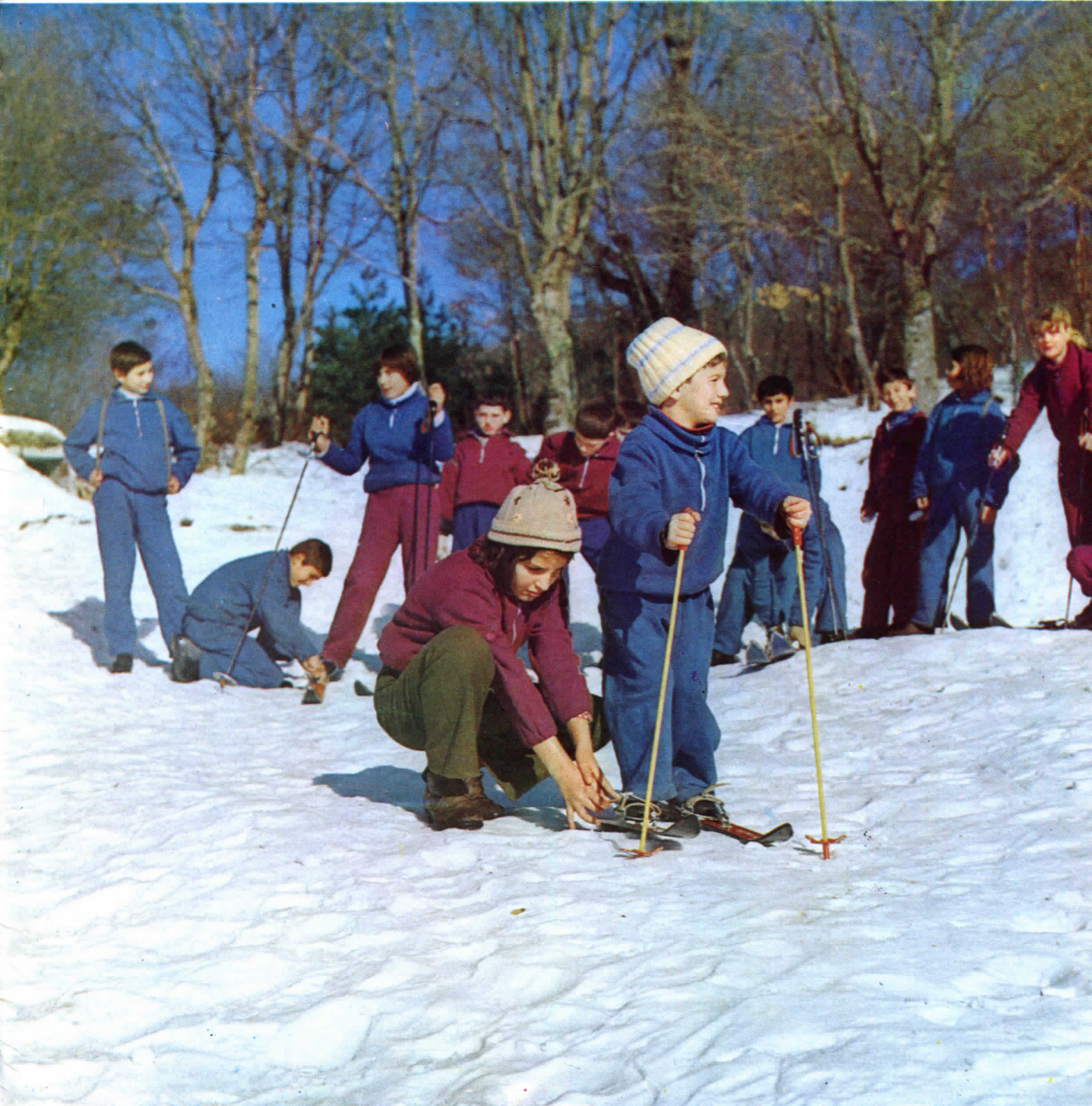
Merry winter holidays for our children