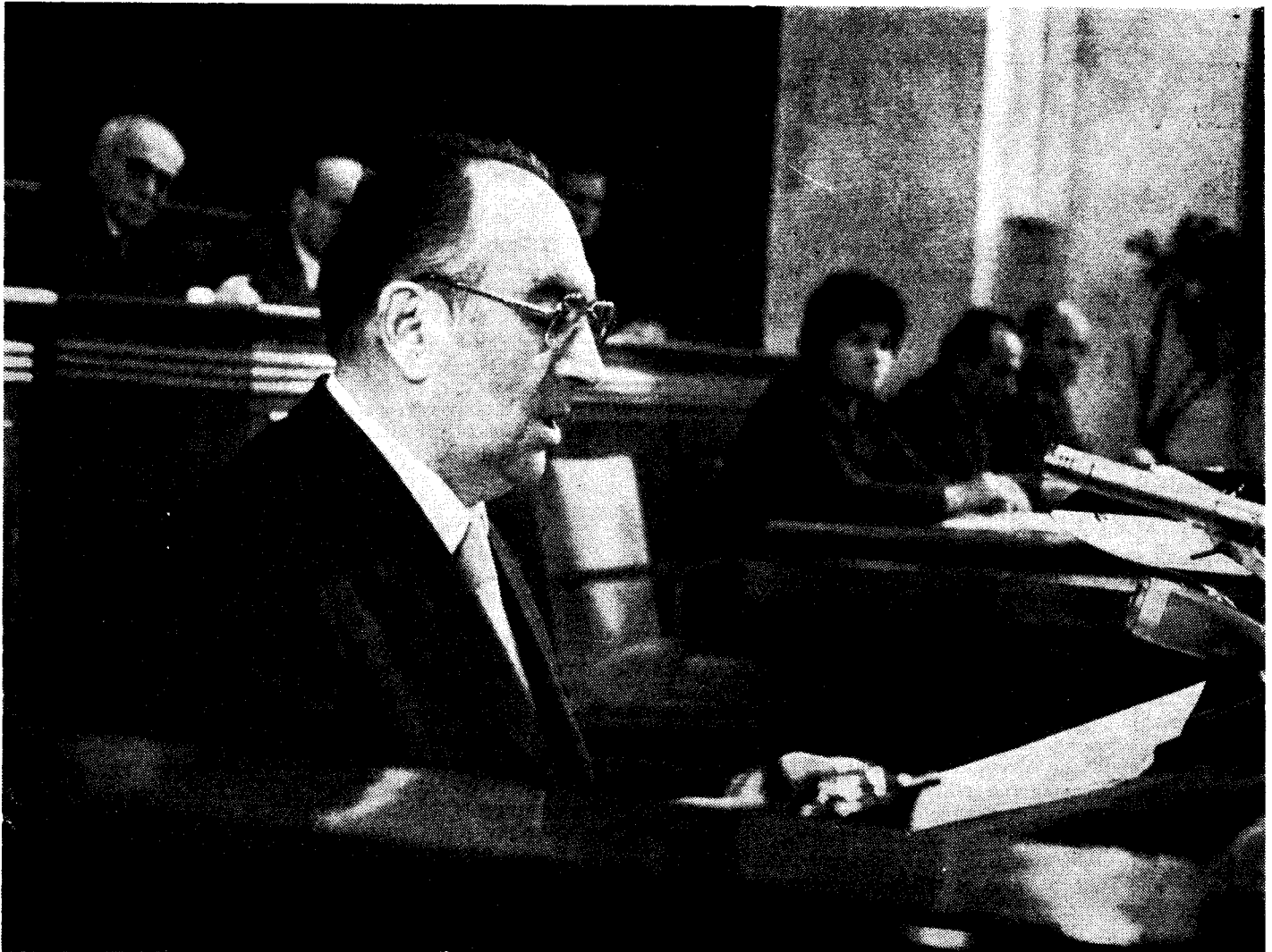
The Chairman of the Council of Ministers of the PSRA, Comrade Adil Çarçani, presenting the program and composition of the Council of Ministers.

The Council of Ministers will take important measures to increase exports of our goods, to improve their structure