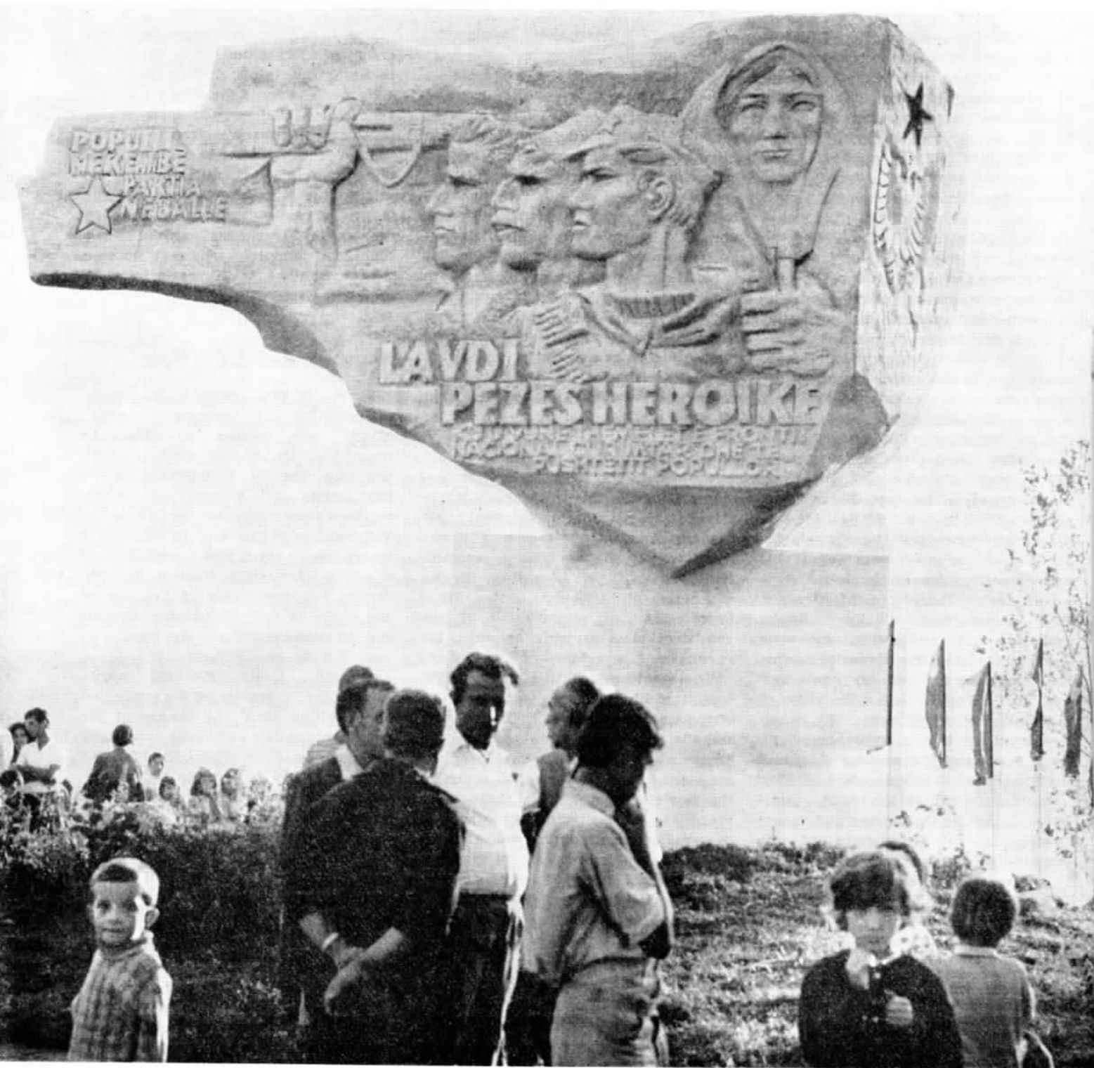
On September 16, 1942 in the Peza village, in the vicinities of Tirana, the historic Conference of Peza was held, which created the National Liberation Front of Albania at the initiative of the Communist Party of Albania (today the PLA). Under the leadership of the Party, the National Liberation Front, together with the entire people of the country, in the war for the liberation of the country from foreign invaders and their tools, laid the bases of the new people's power. Every year, on the 16th of September, thousands upon thousands of people come to heroic Peza to commemorate this important event. This sculptural group is set up to the memory of this event in Peza.